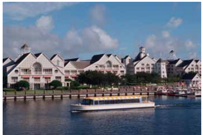
Disney's Yacht & Beach Club Resort