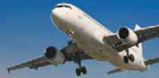
Exhibit Service Contractor

Visit www.floridaairports.org/meetings for updated booth availability.