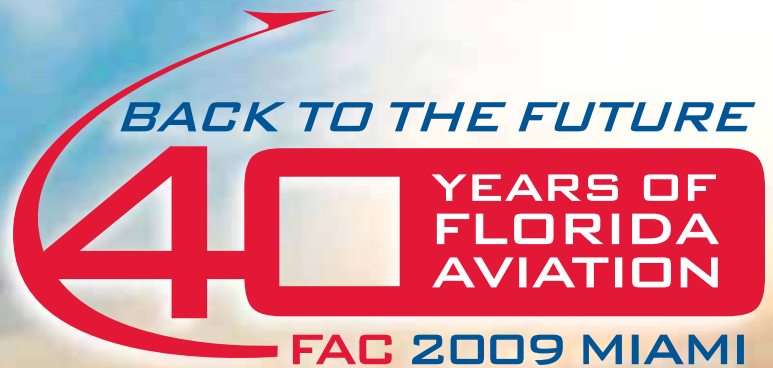
EXHIBIT HALL SPACE AND SPONSORSHIP OPPORTUNITIES ARE LIMITED!

Hosted by Miami-Dade Aviation Department