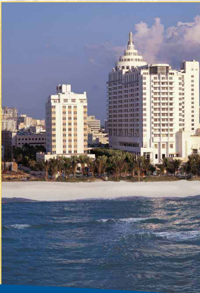
Loews Miami Beach Hotel

FAC expects hundreds of airport, state and federal leaders to attend this great event in picturesque Miami Beach. You do not want to miss the opportunity to exhibit and/or sponsor one of the many events that take place during the conference. Your financial support of the conference helps FAC continue its legislative advocacy and educational programs for another year.