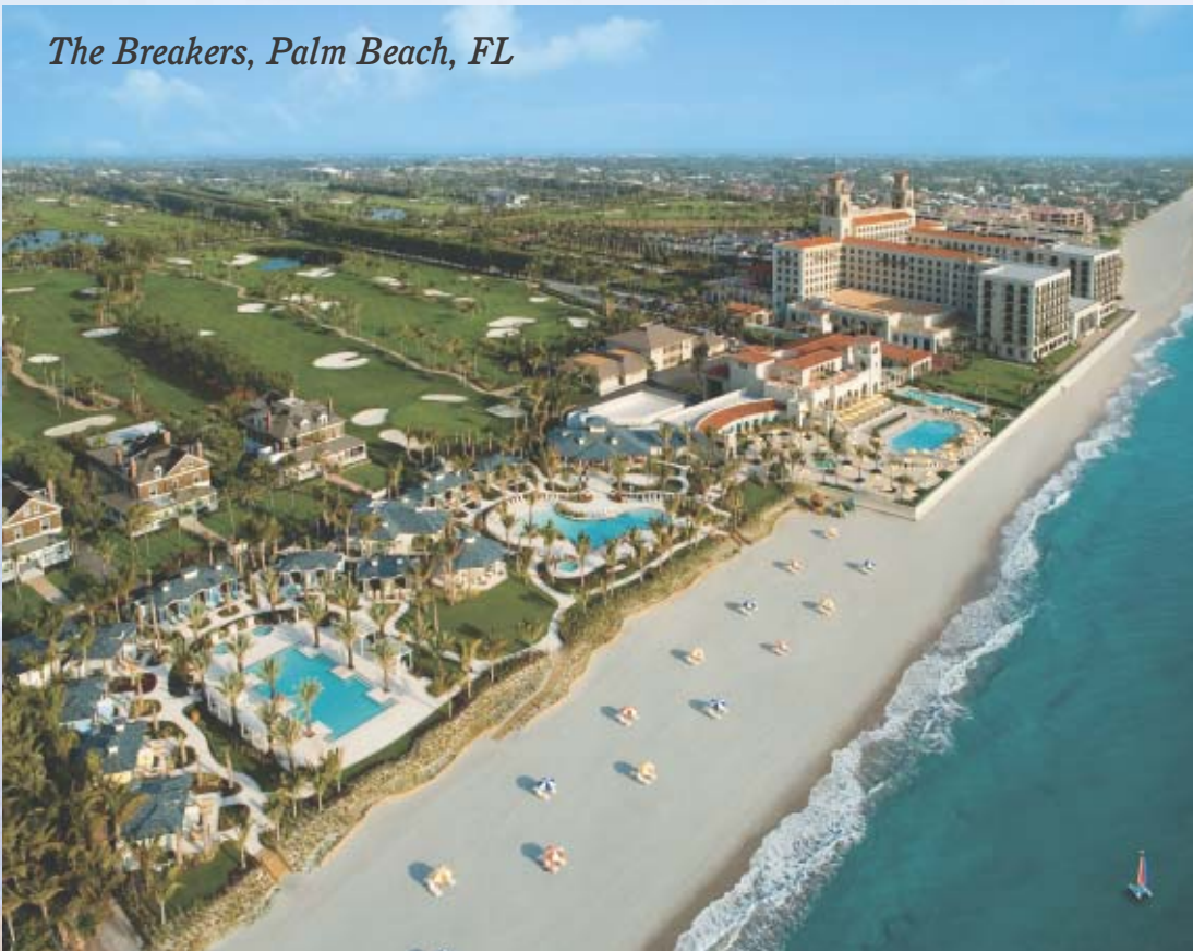
The Breakers, Palm Beach, FL

The Florida Airports Council consists of 20 commercial service airports, 73 general aviation airports and nearly 200 aviation-related businesses and their employees. FAC is the largest and most successful state-focused airport organization in the nation. FAC's 39-year success story is due to leadership from Florida's commercial and general aviation airports and support from Florida's leading aviation companies.